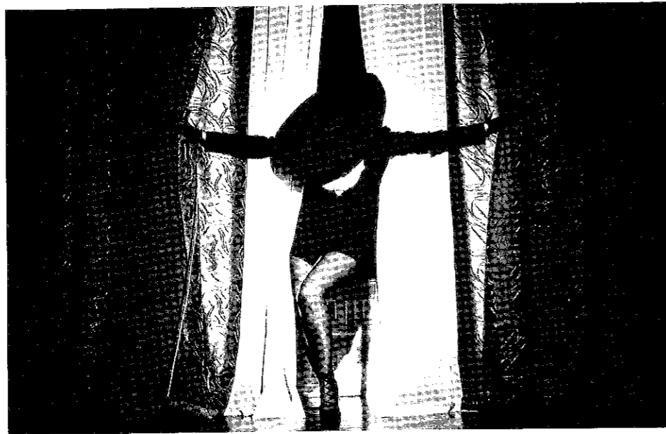
Sláva Daubnerová: Solo lamentoso . Premiered on 10 December 2012 at the SEUK Theatre.