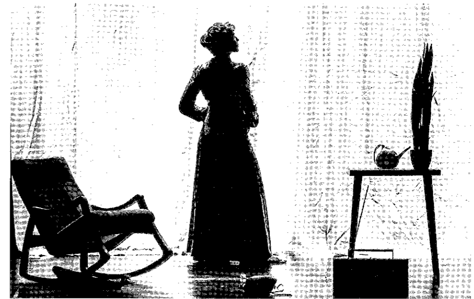
Sláva Daubnerová: Solo lamentoso . Premiered on 10 December 2012 at the SEUK Theatre.