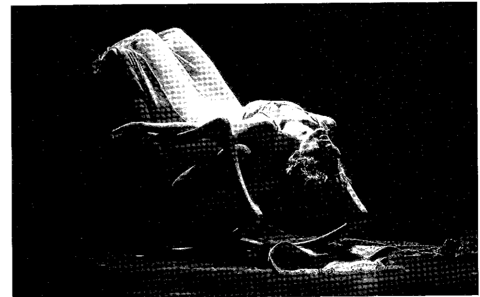
Sláva Daubnerová: Solo lamentoso . Premiered on 10 December 2012 at the SEUK Theatre.